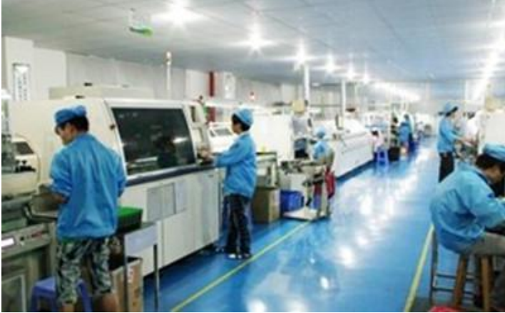
The production line 1